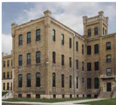
RACINE J. JEFFERS & COMPANY

Racine County leadership is evaluating programs to support the construction and redevelopment of more for-sale housing.