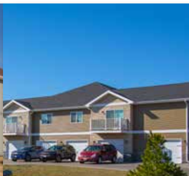
BURLINGTON FAUST DEVELOPMENT