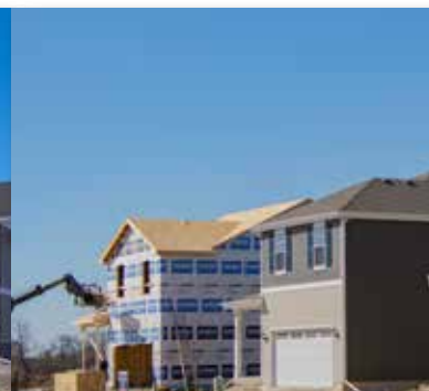
MOUNT PLEASANT BEAR DEVELOPMENT