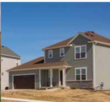
WATERFORD NEUMANN HOMES